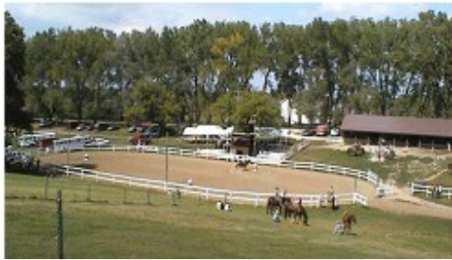
Annual Show Labor Day Weekend

The Wapsie Wranglers were established in 1962 to support the Wapsipinicon Council Horse program. The Wranglers currently maintain a herd of 14 horses and over 8 miles of wilderness horse trails at our camp, Ingawanis Adventure Base near Waverly, Iowa. Our primary objective is to promote horsemanship for youth and community for many generations to come. We do this by providing trail rides, hay rides, steak dinner rides, and our Annual Horse Show, now in it's 50th year. Our camp, trails, and horses are owned by the Winnebago Council, Boy Scouts of America.